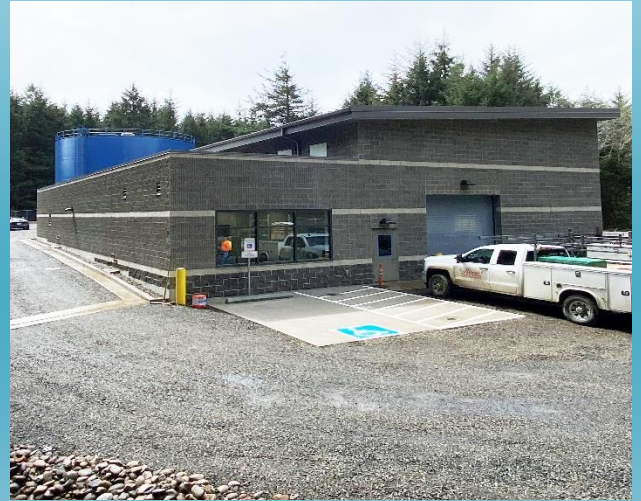
SRWD Membrane Treatment Building Under Construction

SRWD is working with the State and local stakeholders in an effort to develop additional water supply sources. Other water providers in the region are also looking at their options to meet future source water needs. There is enough water for today—but steps need to be taken now to have an adequate supply to meet future demands and provide greater resiliency. Developing a primary water supply for the District supports the region's plans for responsible sustainable growth within the Oregon Coast range. In 2019 the District received a funding package from the United States Department of Agriculture (USDA), along with partner funding from Business Oregon Infrastructure Finance Authority (IFA) to construct a new source water intake on Beaver Creek which will supply water from a new advanced membrane treatment facility east of the Makai Community. Not only will this effort serve to create sustainability it will also meet the States resiliency plan. Work on this important project began June 1, 2020, and is scheduled to be completed in summer 2022.