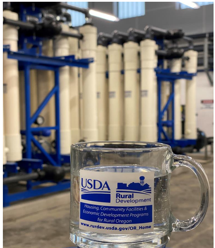
Newly Installed Membrane Water Filtration System:

While the district is not fully operating on the new system we are excited to inform the Seal Rock community that project completion is anticipated very soon. You can have the same confidence in the quality of your drinking water once we are using the new system. The district's new system funded by G.O. Bonds and Grants provided by the State Revolving Loan Fund Program and the US Department of Agricultural (USDA), Rural Utility Assistance Grant Program will continue to deliver the high-quality water that our customers expect, while we continue to meet or exceed all federal and state drinking water standards.