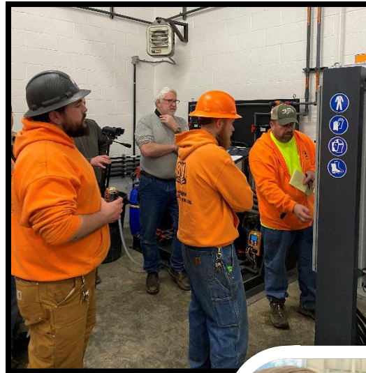
SRWD operations staff participate in functional testing of equipment at the membrane water treatment facility:

Any measure of a successful society — low mortality rates, economic diversity, productivity, and public safety — is in some way related to access to safe water. We often take for granted that safe water is always accessible to drink, to wash our clothes, to water our lawns, and for a myriad of other purposes.