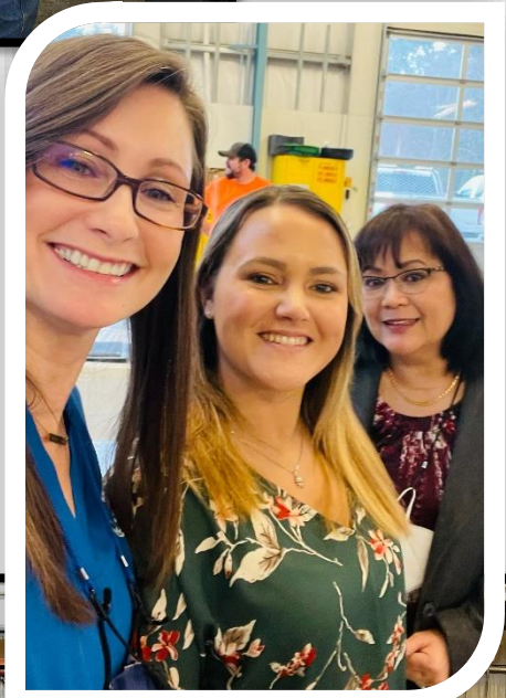
Friendly and courteous SRWD Administration Staff: