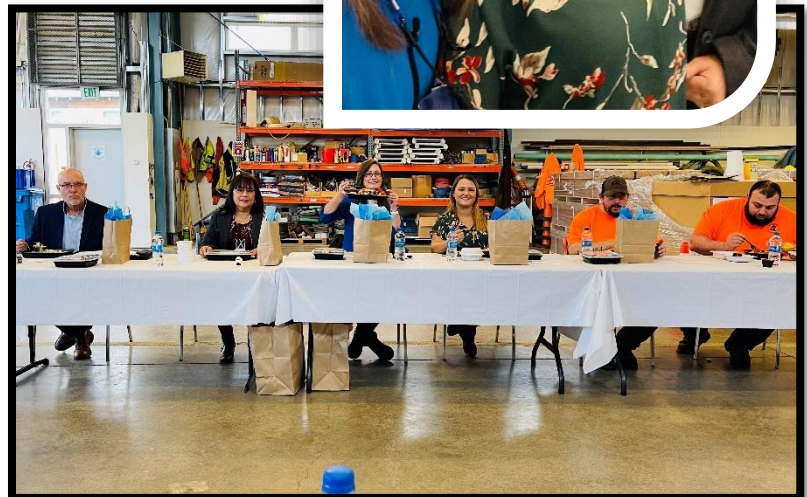
SRWD 2021 Board and Staff Appreciation Luncheon