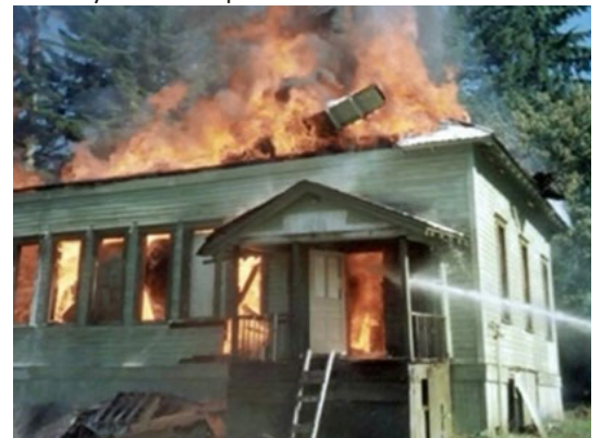
Fire protection is an important function of SRWD