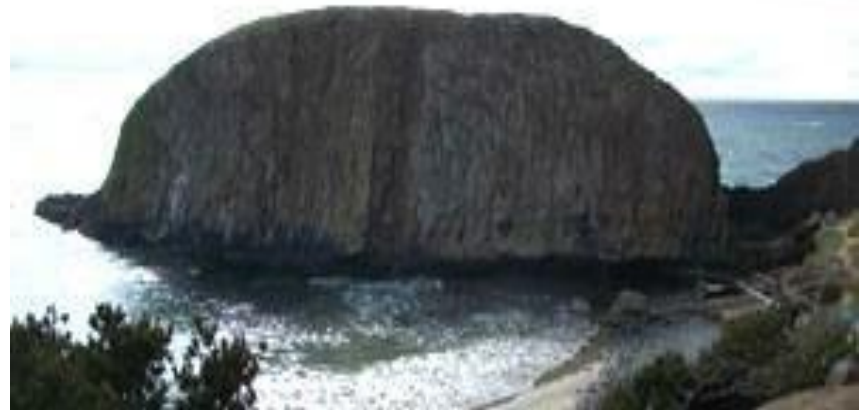
Seal Rock State Park