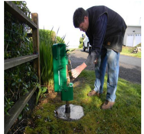
SRWD Technician takes a water sample from one of the District's many sampling stations:

The EPA prescribes regulations which limit the amount of certain contaminants in water provided by public water systems. Food and Drug Administration regulations establish limits for contaminants in bottled water, which must provide the same protection for public health. The 1996 Amendments to Safe Drinking Water Act require the EPA to go through several steps to determine whether setting a standard is appropriate for a particular constituent, and if so, what the standard should be. Peer-reviewed science and data support an intensive technological evaluation, which includes many factors: occurrence in the environment; human exposure and risks of adverse health effects in the general population and sensitive subpopulations.