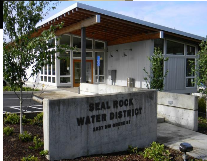
SRWD Administration Building:

SRWD Technician monitors system conditions using the District's state of the art Supervisory Controlled Data Acquisition (SCADA) system: