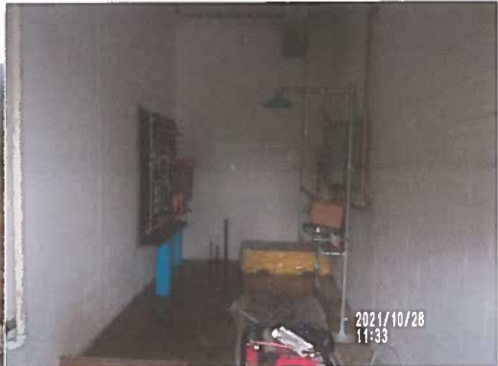
View of the mechanical room of the RW Intake Building: