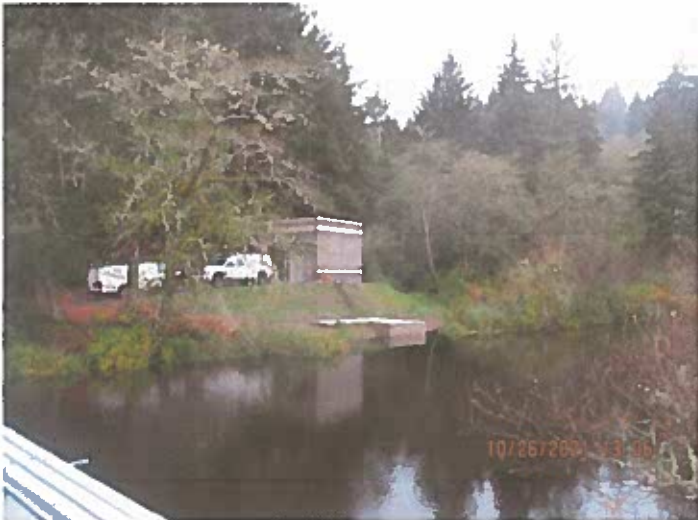
View of intake from South Beaver Creek Bridge: