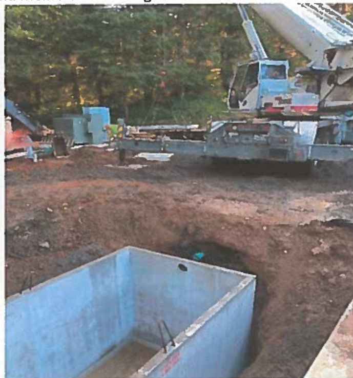
View of the precast sanitary holding tank installation north of the Backwash Basin:

The Contractor continues to make steady progress in construction. Per recent design progress schedule, which does not meet contract dates, the approximate slippage that the Contractor is showing is an additional 86 days. These dates can only be approved via change order. Jacob's software integration team continues to coordinate with the contractor's subcontractor and WesTech to complete software development. Software integration between WesTech and the balance of the plant continues with programming and testing in progress.