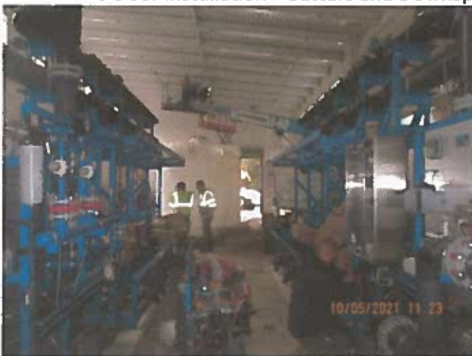
WTP Filtration Skids: