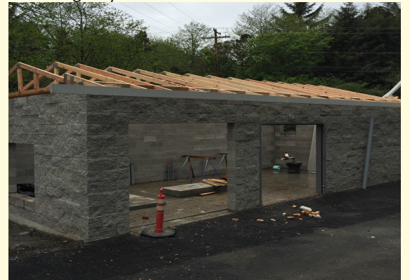
SRWD/Newport pump station and Intertie:

The District also has a connection with the City of Newport which is being improved through a grant provided by FEMA. The District's current intertie is insufficient to provide water in the event of failure in the District's Supply System. SRWD is currently in the construction phase of installing a new intertie and pump station capable of providing water in both directions, strengthening the District's ability to provide service in the event of an emergency.