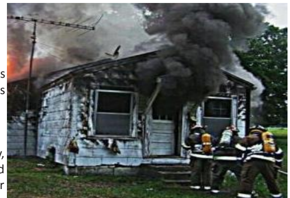
Fire protection is an important function of SRWD