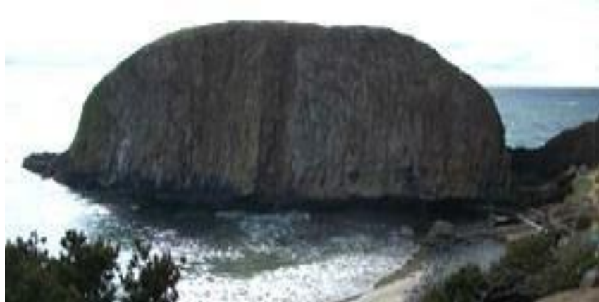
Seal Rock State Park

The Seal Rock Water District consistently delivers water that meets or exceeds all federal and state standards.