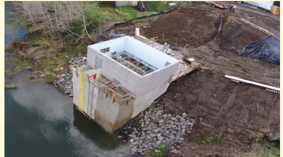
Newly Constructed Siletz River Intake:

SRWD is committed to having multiple quality water supplies. This redundancy allows SRWD to better manage resources to reliably provide water to customers.