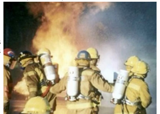
Fire protection is an important function of SRWD