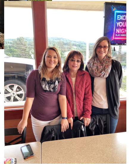
Friendly and courteous SRWD Administration Staff: