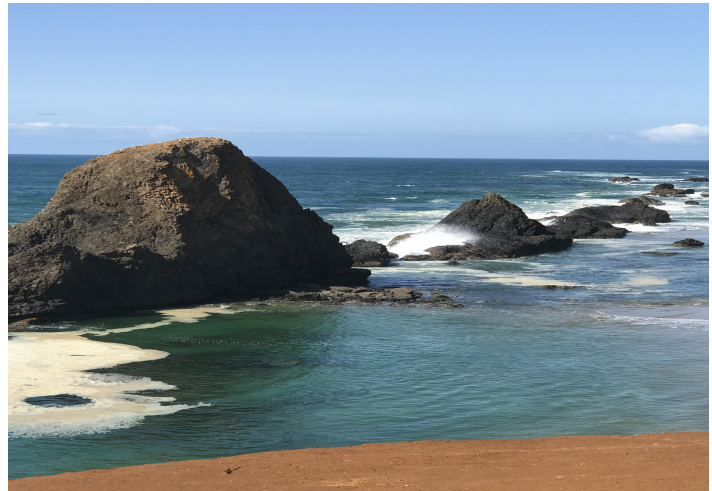
Seal Rock State Park:

Issued June 2018, contains water quality data for the year 2017. You can have confidence in the quality of your drinking water. The Seal Rock Water District consistently delivers water that meets or exceeds all federal and state standards.