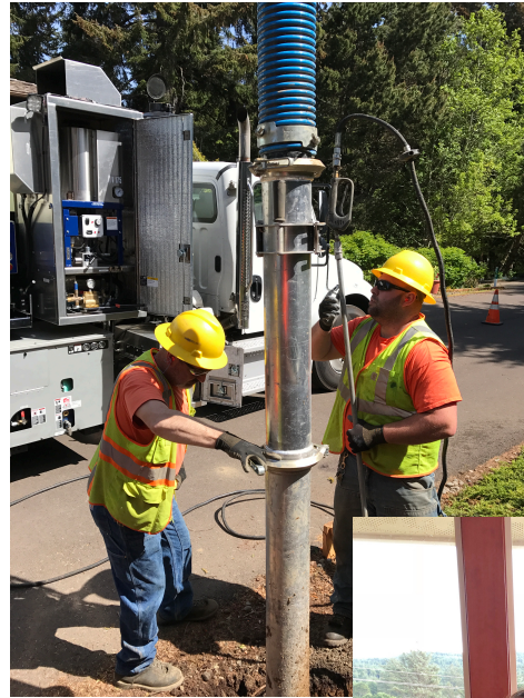
SRWD Distribution Operators safely maintain over 65-miles of distribution system.

Any measure of a successful society — low mortality rates, economic diversity, productivity, and public safety — is in some way related to access to safe water. We often take for granted that safe water is always accessible to drink, to wash our clothes, to water our lawns and for a myriad of other purposes.