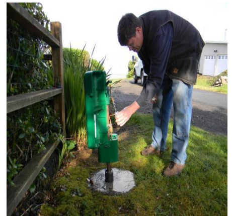
SRWD Technician takes a water sample from one of the District's many sampling stations:

The EPA prescribes regulations which limit the amount of certain contaminants in water provided by public water systems. Food and Drug Administration regulations establish limits for contaminants in bottled water, which must provide the same protection for public health. The 1996 Amendments to Safe Drinking Water Act require the EPA to go through several steps to determine whether setting a standard is appropriate for a particular constituent, and if so, what the standard should be. Peer-reviewed science and data support an intensive technological evaluation, which includes many factors: occurrence in the environment; human exposure and risks of adverse health effects in the general population and sensitive subpopulations.