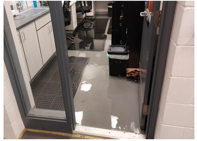
Operator Control Room:

Operators at the water treatment plant were alerted in the evening hours on Thursday, July 6<sup>th</sup> of water on the floor at the WTP. Crews arrived to discover that a pipe connecting the lower end of a membrane module had completely shattered. This created a substantial amount of flooding throughout the building including the operations and electrical room. While operators were able to complete repairs to the module, they spent a considerable amount of time performing extensive cleanup. Operators are working with engineers and the manufacturer (WesTech) regarding what may have caused the pipe to shatter.