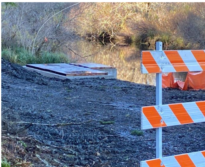
Backside of intake structure:

This month in-water work at the intake site was completed. Site stabilization continues to be monitored for settling before construction of the electrical building can begin. Contractor continues to monitor erosion control efforts at this site to ensure that the project complies with all environmental conditions.