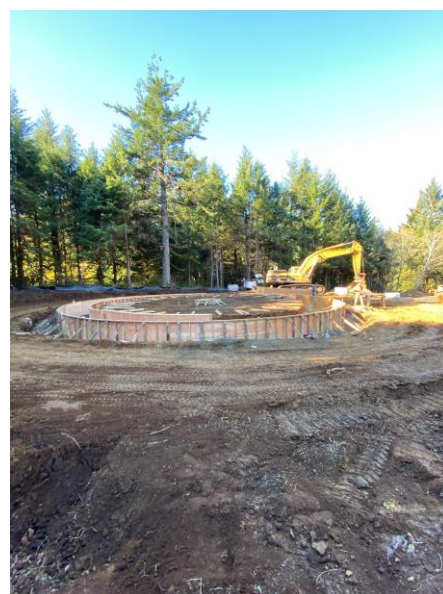
Clearwell ringwall forms: