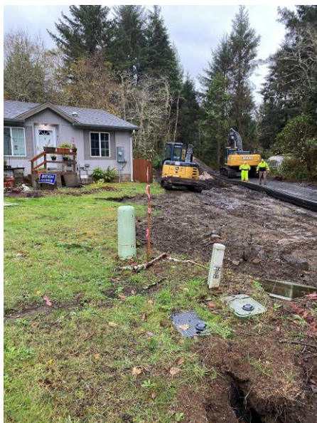
Pipeline into Makai Community:

With the exception of installing the pipe gallery at the intake site, the contractor is scheduled to complete all the piping installation for the project by the end of the year. This includes all the piping on Tax Lot-500 and through the Makai Community. Weather conditions permitting, the contractor would like to complete all the asphalt resurfacing through Makai as well. Grinding and pavement were completed on Beaver Creek Road, along with the striping. Work began on the clearwell tank foundation with cutting out the structure and compacting around the ringwall. Concrete was poured for the ringwall on November 22 nd and the contractor is prepping the footings for the water treatment building now.