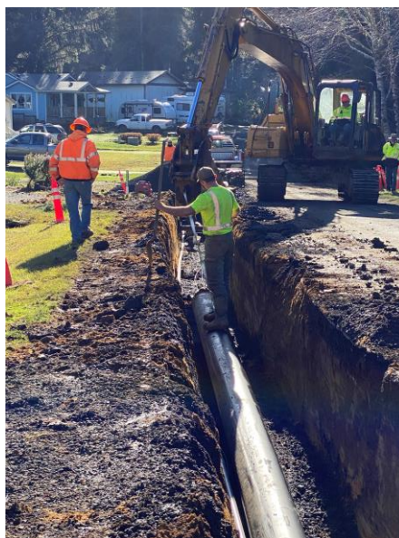
Kona Street pipeline installation: