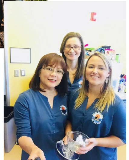
Friendly and courteous SRWD Administration Staff: