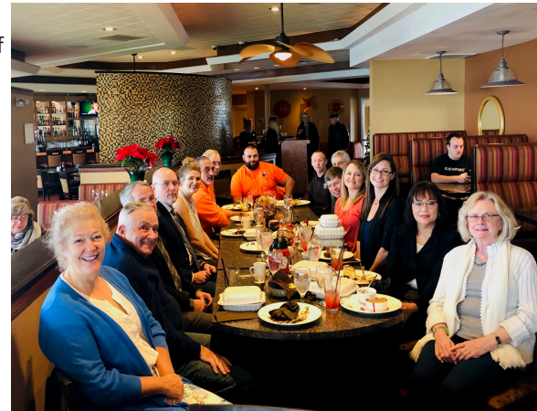
SRWD Board and Staff Appreciation Luncheon